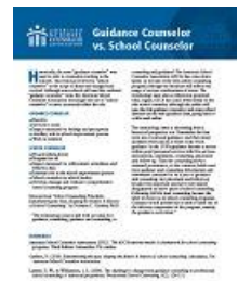
Guidance vs School Counselors