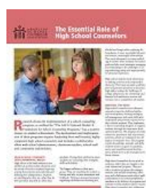
Essential High School Counselors