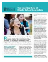
Essential Middle School Counselors