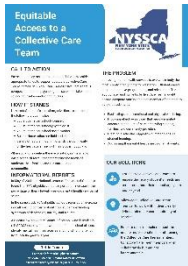
Supporting Equitable Access to the Collective Care Team