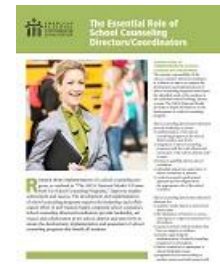
Essential Counseling Directors