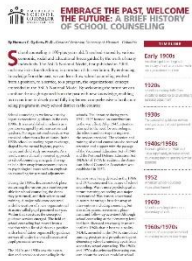
History of School Counseling