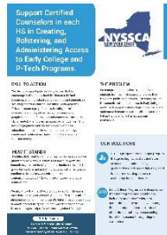
Supporting Cert. School Counselors in each HS-Early College/P-Tech