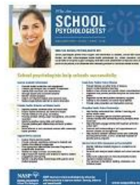
Role of School Psychologist