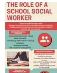
Role of School Social Worker