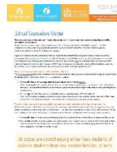
School Counselors Matter