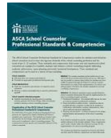
ASCA School Counselor Prof Standards & Competencies