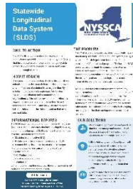
Supporting the Statewide Longitudinal Data System (SLDS)