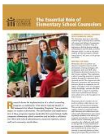
Essential Elementary School Counselors