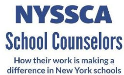
School Counselors Making a Difference Video