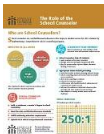
Who are School Counselors?