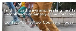
School Counselors We Got You