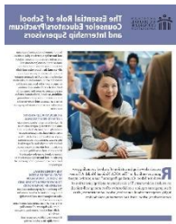
Essential Counselor Educators