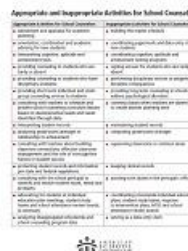
Appropriate & Inappropriate SC Activities