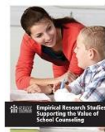
Effectiveness Studies Supporting the Value of School Counseling