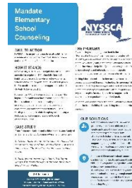
Supporting Mandatory Elementary School Counseling