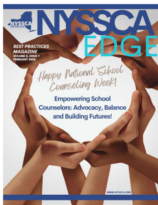
# 5 Feb 2025